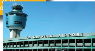
La Guardia Airport