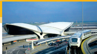
John F. Kennedy (JFK) International Airport