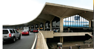
Newark International Airport (EWR)